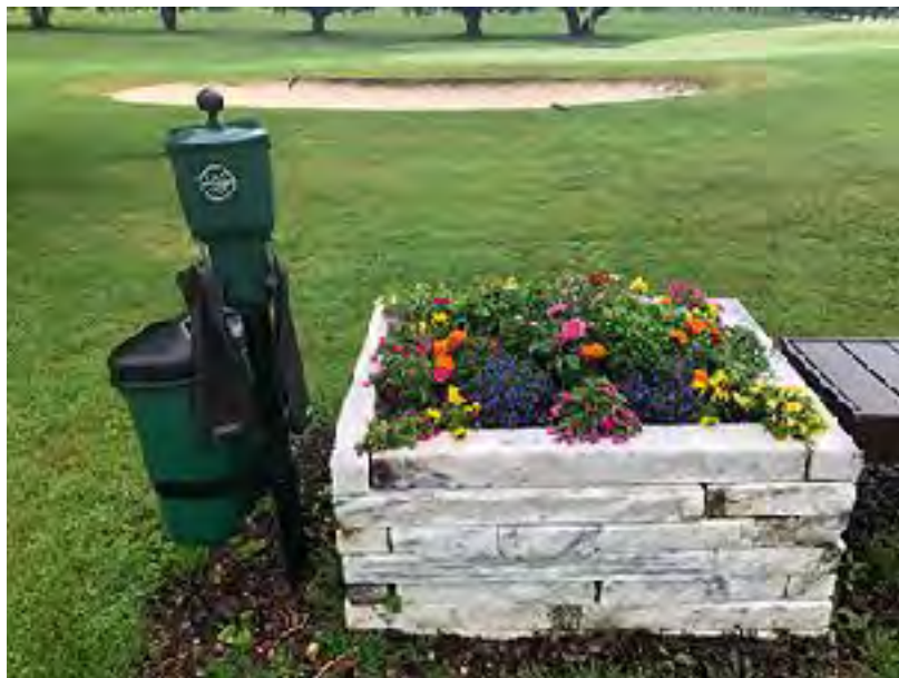
Recently upgraded floor boxes, ball washers and towels, thanks to Greens Club participation

The Greens Club has changed slightly over the last several years. A committee now decides where to spend the money in conjunction with the course superintendent, and the board of directors. Tickets can now be purchased for $40 each, or 3 for $100 through an annual mailing, but they are also available at the Pro-Shop and online line via the club's website. There are 20 weekly drawings starting in May and running into September. The first ticket drawn each month is worth $100, while the others remain at $50 each. We still have a scramble tournament and light dinner at the end of the year where the final drawing will award prizes ranging from $100 to $500 depending on the number of tickets sold. Recent ticket sales have been over 350 per year, bringing in about $12,000 in sales allowing about $6000 per year to be returned to the club for special projects and course enhancements.